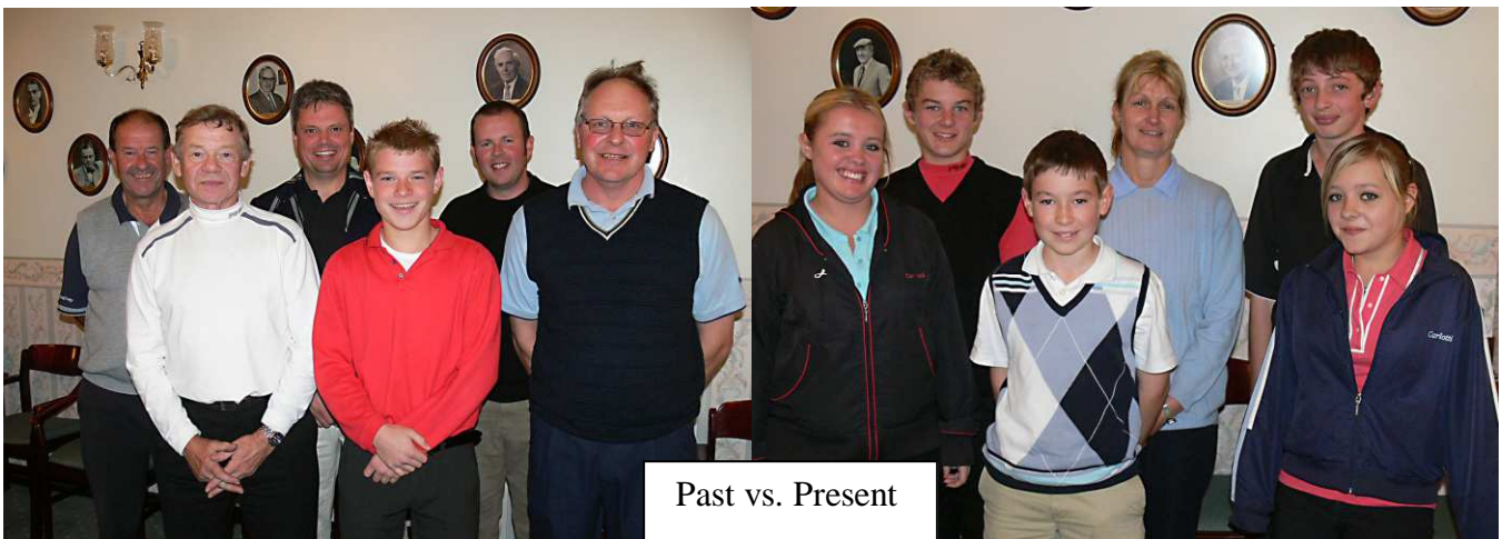
Past vs. Present