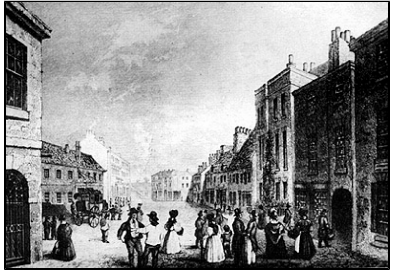
Brigg market place and Buttercross in early Victorian days

A visit today to what is now the upper school shows that it is proud of its roots and traditions. The original schoolroom is now home to a modern, computerised library.