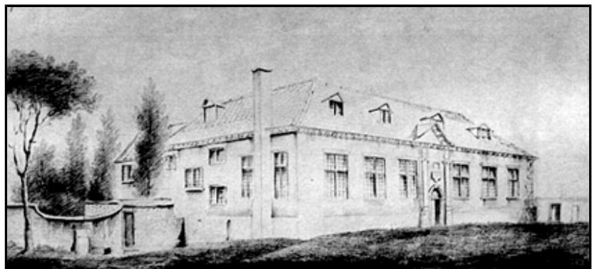
Another view from the end of the 18th Century

The School was built slowly, but well - it's still there. Behind the Schoolroom were the lodgings of the Master and the Usher (who usually did most of the actual teaching). Up above in the garrets were rooms for servants and boarders.